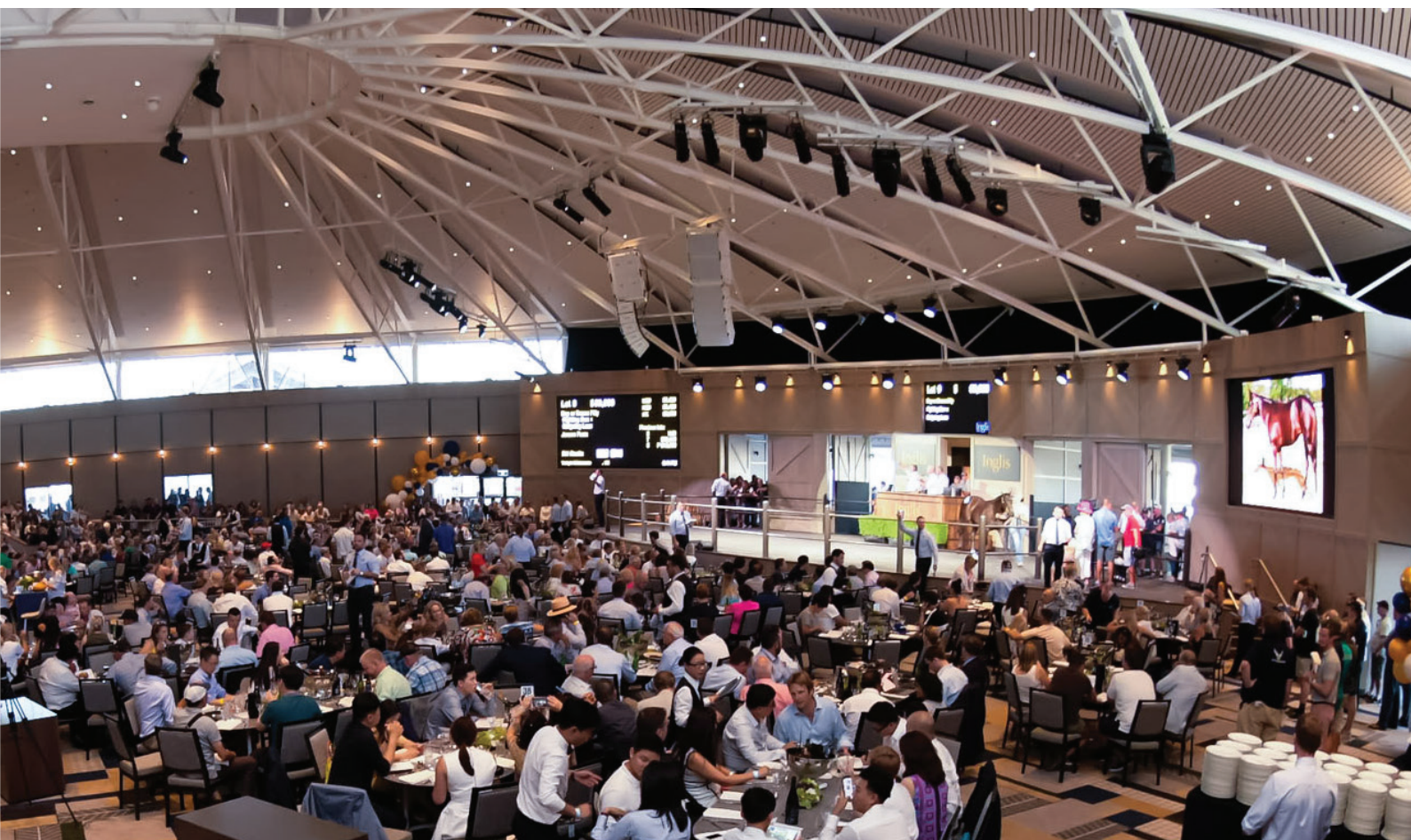
The William Inglis Riverside Stables, Sydney